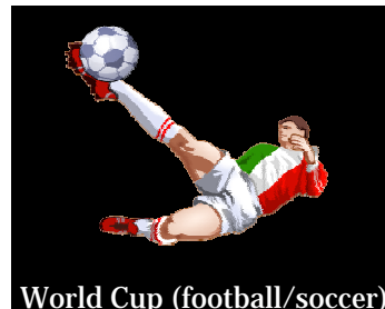
World Cup (football/soccer)