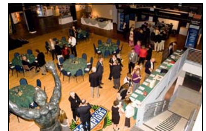
An Evening of Champions