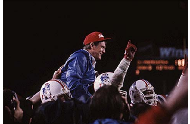
Patriots head coach Raymond Berry being carried off the field after his team's 1985 AFC Championship upset win over the Miami Dolphins, a win that broke a string of 18 straight losses at Miami's Orange Bowl.

The Hall at Patriot Place presented by Raytheon launched its newest exhibit titled "A Wild Ride – The Story of the 1985 Patriots." The 1985 New England Patriots were the first Wild Card team in NFL history to win three road playoff games to reach the Super Bowl. On the road to Super Bowl XX, the Patriots defeated the Dolphins to capture the AFC Championship at Miami's Orange Bowl where the Patriots had lost 18 straight games and had not won since 1969. The exhibit will remain on display through the spring to celebrate the 25 th anniversary of that team's accomplishment.