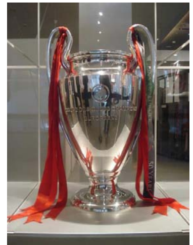
Champions League Cup on display at the Thessaloniki Olympic Museum

Correction: The March newsletter stated that the International Sports Hall of Fame and Olympic Museum in Depoe Bay, OR is the only Olympic Museum in the USA. There are in fact several other Olympic museums in the US, including ISHA members the 1932 and 1980 Lake Placid Winter Olympic Museum, in Lake Placid, NY and the LA84 Foundation in Los Angeles, CA.